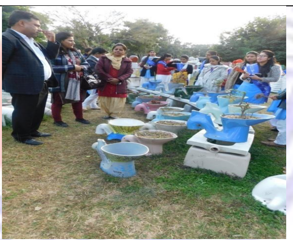
Herbal Garden at college campus