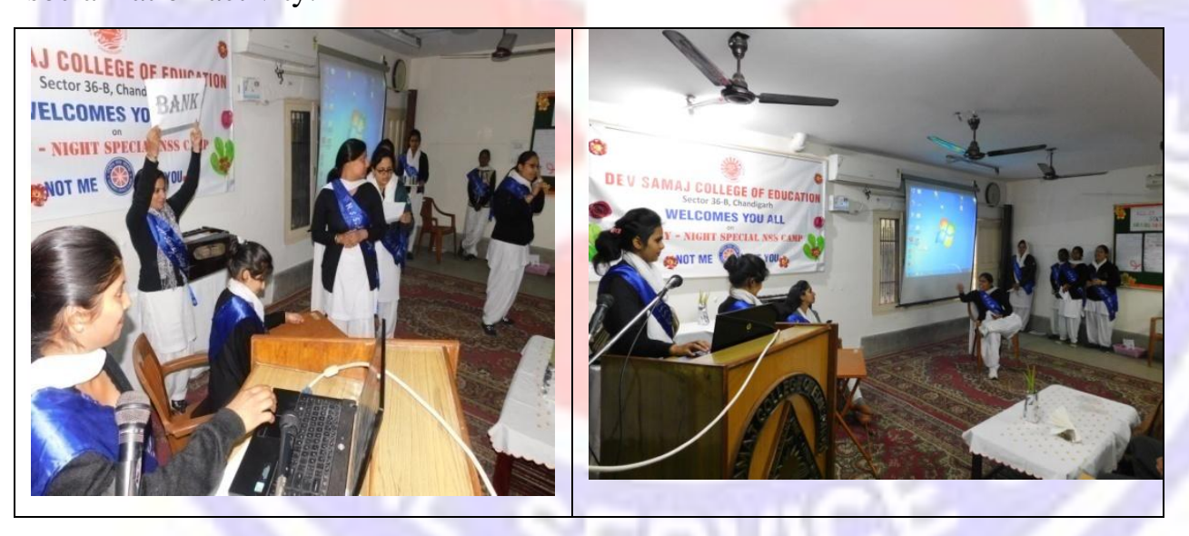
Day-3 SURVEY ON SANITATION QUALITY USE ACCESS AND TRENDS (SQUAT) &

The last session of day, two of the camp was concluded organizing a small workshop on role play.NSS volunteers presented a skit on demonetization and digital India to give a message to the mass not to get afraid from demonetization and to come forward to support cashless transactions. The skit was self composed, self choreographed and presented in the college as well as at the adopted village Buterla, Chandigarh. The sole aim of the workshop was to prepare student volunteer to be the ambassador for the awareness programs in promotion of cashless transactions and digital India. Apart from tired of entire day activities volunteers energetically played their assigned roles. As a whole it was informative, interesting, exploring and well socialization activity.